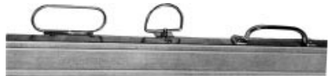
BAIL HANDLES stock #1007

HANDLES - A variety of handles are available, at an additional charge, to be attached to the Smith Mist Eliminator. Three of these handles are: